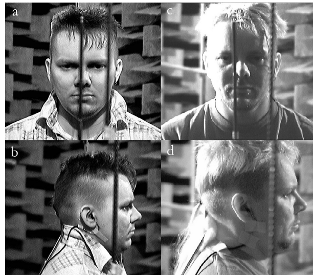
Fig. 1. Accuracy of the test subject positioning procedure, subject R2 taken as an example. A) 02/1997, \theta=0^\circ ; b) 02/1997, \theta=90^\circ ; c) 09/1997, \theta=0^\circ ; d) 09/1999, \theta=90^\circ .

The data investigated here applies the left ear responses of subjects R1 and R2 , see Fig. 2. The right ear photographs and measurement data are studied in the facing paper [4]. The third part [5] focuses on the influences of head movements and incorrect postures.